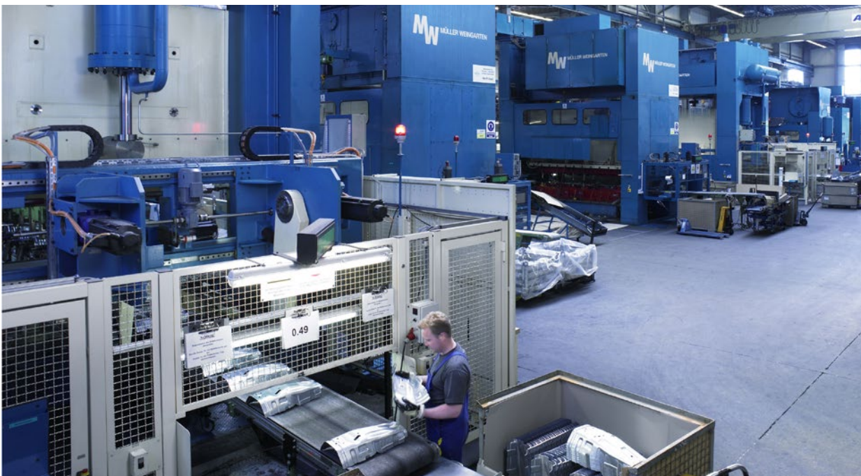
Fig. 1: GEDIA will implement the full-surface optical 3D coordinate measurement worldwide at all production sites and at all relevant facilities, such as press shops, welding shops and assembly.

Like many companies that have to adjust their processes to accommodate increased production levels, GEDIA was challenged to find a way to cut measurement times. At the same time, quality had to be maintained, although cycle times grew shorter and production output increased. However, the relatively slow tactile measurement of parts, which often have complex shapes, results in long occupation times and complex logistics, and even then, only a few points on the part are checked.