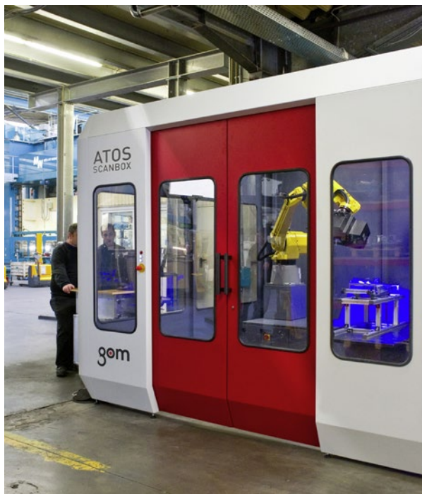
Fig. 5: The standardized ATOS ScanBox comes with all elements required for fully automated 3D digitizing and inspection. In GEDIA's Attendorn press plant, it has helped cut measuring times by more than half in comparison with previous tactile solutions.