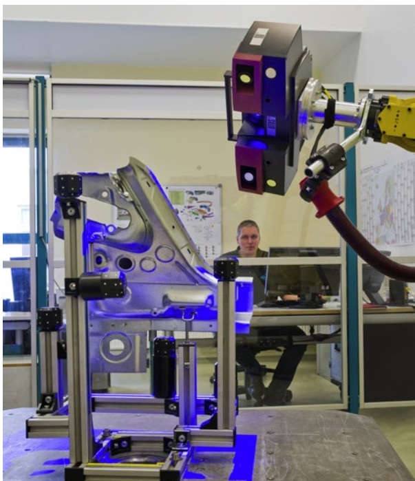
Fig. 4: The first automated solution at GEDIA: a customized measuring cell with integrated GOM equipment.