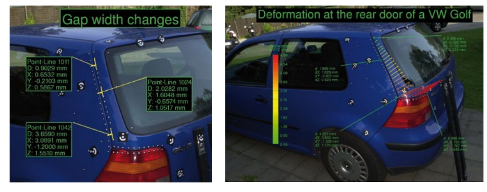
Fig. 3: Gap-width change