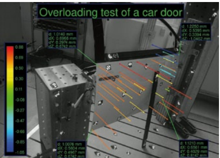
Fig. 2: Displacements of a car door

First of all, an arbitrary number of circle markers are applied by the user as points of measurement onto the surface that is to be measured. Using a high-resolution digital camera and the TRITOP software, the 3D coordinates of these points are determined. The project-oriented deformation module enables the convenient administration of any number of deformation steps. Apart from the 3D coordinates of the points of measurement, the 3D displacement vectors with regard to the individual states can be determined. This information is projected into the 2D images and thus, by using arrows and error color map display methods, enables a clear and quick interpretation of the component's deformation. The user can furthermore use tailor-made analysis tools to measure, visualize and protocol gap-width changes and gap alignment.