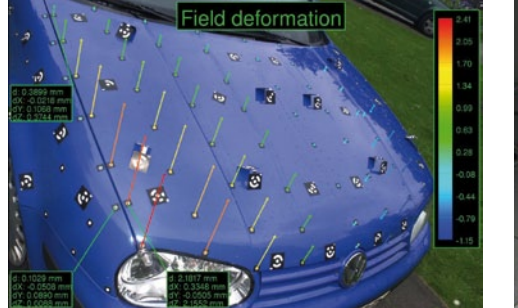
Fig.1: Deformation of a car bonnet

The photogrammetric system TRITOP with its new deformation module offers a reliable analysis and a graphic visualisation of such deformations. This tough and flexible measuring technique can be used even under extreme environmental conditions as e.g. temperatures from -40 to +90 degrees or in the limited space of a car's interior.