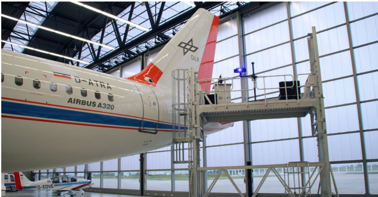
Fig. 1: GOM supports DLR in its aeronautical research by providing precise measurements of the part geometries.

The German Aerospace Center (DLR) uses non-contact measuring systems for fundamental and application-specific aeronautical research. In this regard, DLR uses GOM's optical measuring systems for its research aircraft "ATRA" (Advanced Technology Research Aircraft) – an airbus A320.