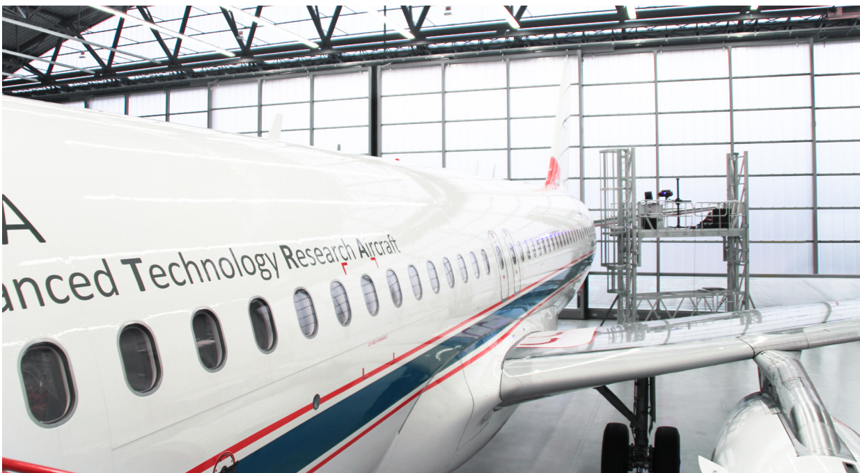
Fig. 2: The Advanced Technology Research Aircraft has been in use at DLR since 2008 in the field of aerodynamics research.

In the future, the qualitative knowledge gained by DLR's aerodynamicists concerning the sensibility of the flow with respect to the wing geometry is supposed to be applied on the wing and fuselage. As a consequence, the researched effect can be used extensively to improve the performance of aircrafts and to allow a more energy-efficient and eco-friendly production.