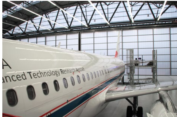
Fig. 3: The Advanced Technology Research Aircraft has been in use at DLR since 2008 in the field of aerodynamics research.

In order to research the transition from laminar to turbulent flow and to influence it in a further step, a part of the empennage was taped with a foil showing a defined roughness that makes the wing surface more homogeneous. In addition, any waviness and other influencing factors, such as weld seams and rivets, were filled and straightened. Afterwards, the complete surface of the modified component was measured with GOM's optical measuring systems in a non-contact way. To measure the 3D coordinates of the object, the empennage of the Advanced Technology Research Aircraft was first measured with the portable TRITOP system, which